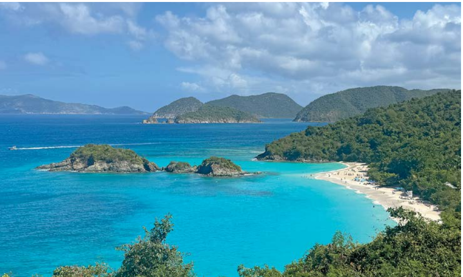
Trunk Bay on St. John is ranked number 1 on the 2024 list of The World's 50 Best Beaches.

On the food and culture front, the USVI is delivering through its vibrant culinary scene, world-class sailing and cultural festivals that celebrate the islands' rich heritage. Long known for its gastronomy, the territory offers a fusion of Caribbean, African and European flavors, with acclaimed local chefs bringing USVI cuisine to the global stage. "The USVI doesn't just offer a place to visit, we offer an experience that stays with you," Boschulte says. "From food festivals to historical walking tours, our visitors can truly immerse themselves in the culture of the islands." The USVI held its first ever tourism summit in 2024, which brought together industry leaders, local business owners and government partners to chart the