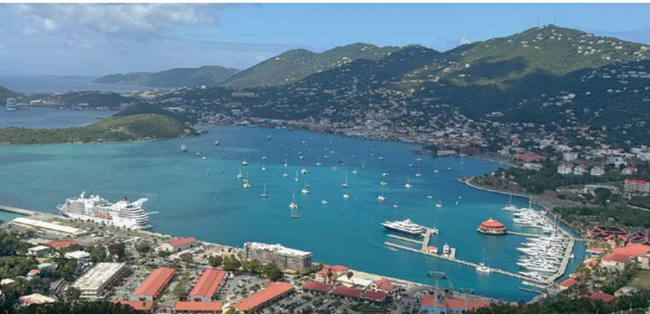
Charlotte Amalie, located on St. Thomas, is the capital and largest town of the U.S. Virgin Islands.

With a four percent unemployment rate and $17 billion in construction projects, manpower is also a challenge. My vision is to lower energy costs to enable AI and robotics-driven light manufacturing, supported by a skilled workforce. Only