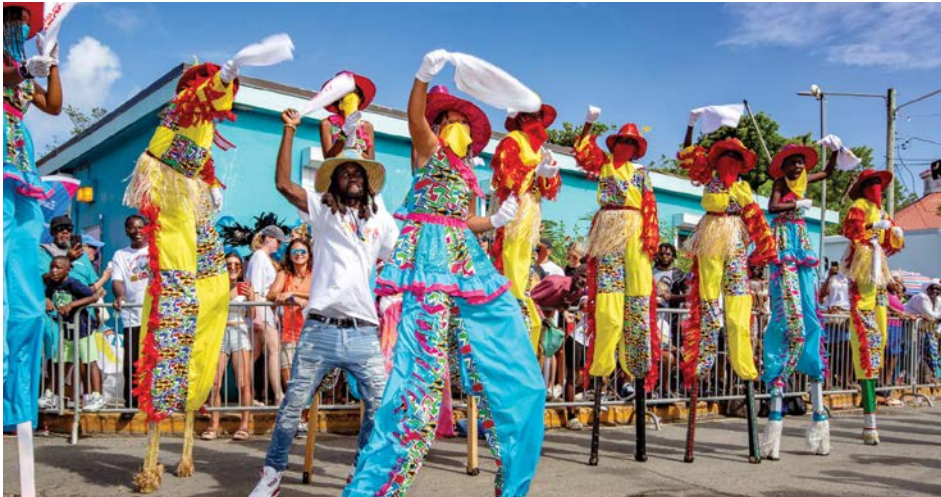
Moko jumbies, a traditional form of stilt-walking dancers are a cultural icon of the USVI.

Whether you are a long-time player or a first-time buyer, the VI Lottery offers excitement, opportunity, and a chance to make dreams come true. Play now and celebrate over eight decades of winning and community impact.