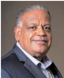
Joseph Boschulte Commissioner U.S. Virgin Islands Department of Tourism

The U.S. Virgin Islands have firmly established themselves as a leading force in Caribbean tourism, experiencing record-breaking visitor numbers and unprecedented economic growth. Thanks to strategic investments in airlift, hospitality and infrastructure, the territory continues to captivate travelers with its blend of accessibility, culture and world-class experiences. As the USVI looks ahead, the momentum is stronger than ever, positioning the islands for sustained success in the global travel market.