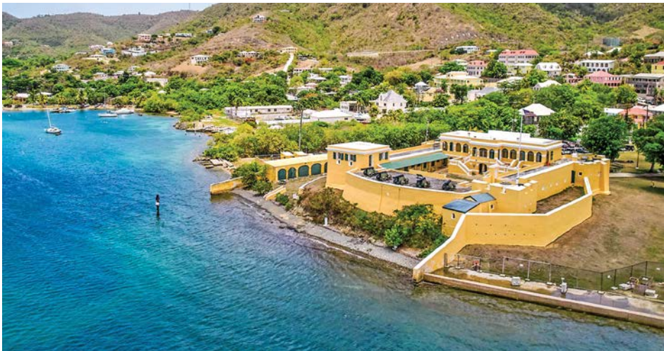
Fort Christiansvaern is a Danish colonial fort in Christiansted on St. Croix completed in 1749.