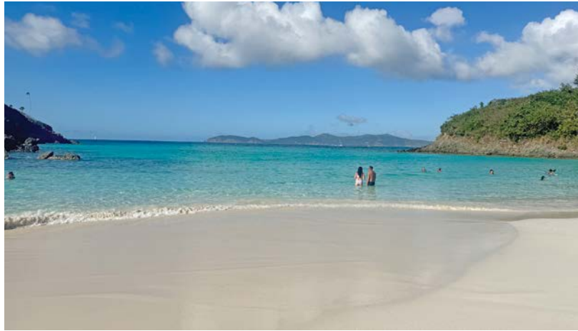
Trunk Bay gets its name from leatherback turtles which are known locally as trunks; the annual carnival celebrations attract locals and visitors alike; Fort Christian in St. Thomas dates from 1672-1680.