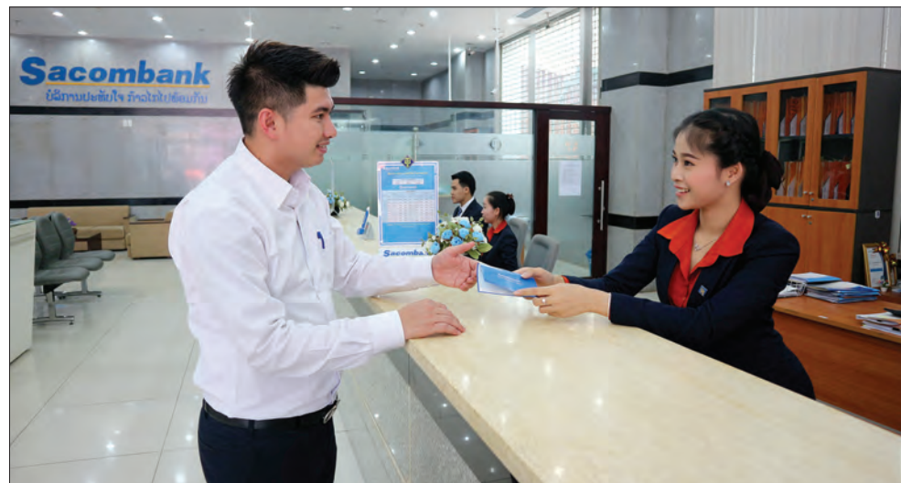
Sacombank is a friendly and fast growing financial services provider in Laos and Southeast Asia.

One bank that has transcended borders in Southeast Asia is Sacombank, a Vietnamese company that is a strong force in its home market and a growing