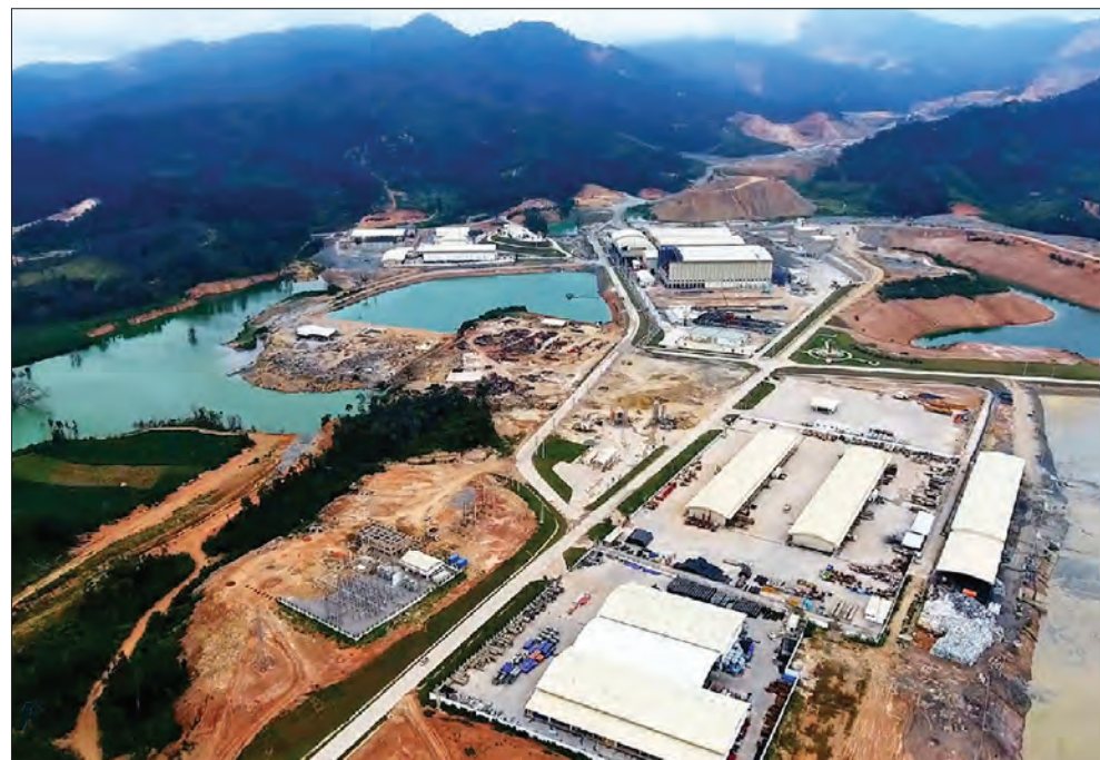
Phonesack Group's Gold Processing Plant