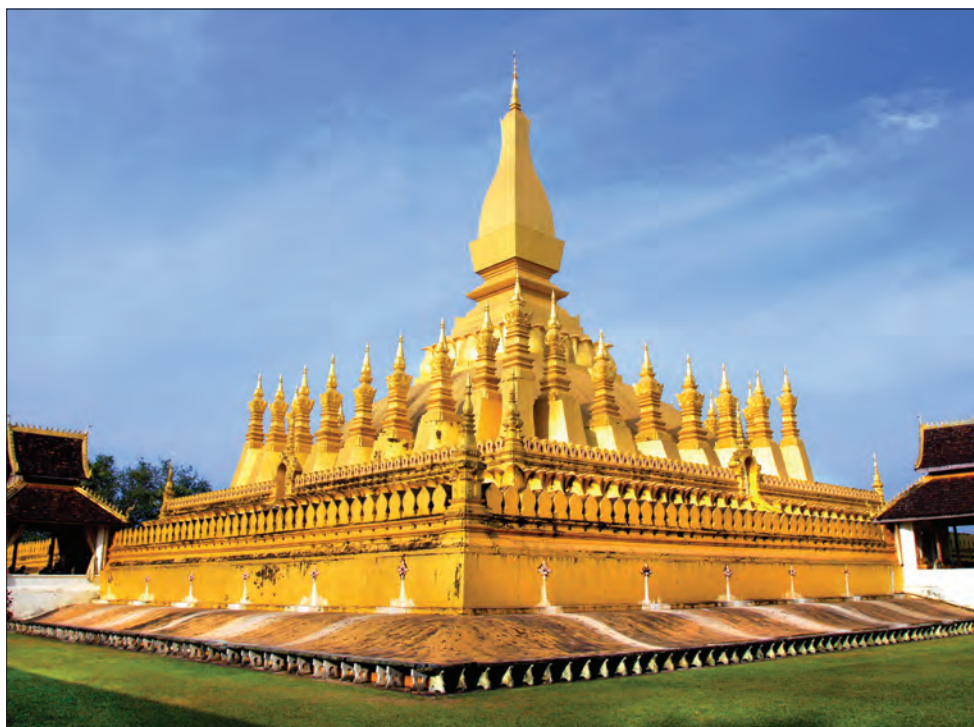
Pha That Luang Temple

The company's flagship brand has won several international awards for its taste and quali-