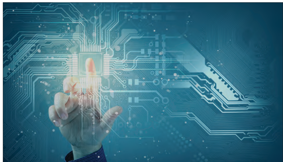
A digitalisation drive is paying dividends for SMEs that have invested significant sums in new IT.

Regardless of the sector in which they operate, SMEs throughout Laos will be seeking to follow the sterling example set by the TK Group, a diversified private company with interests in IT, architecture and design,