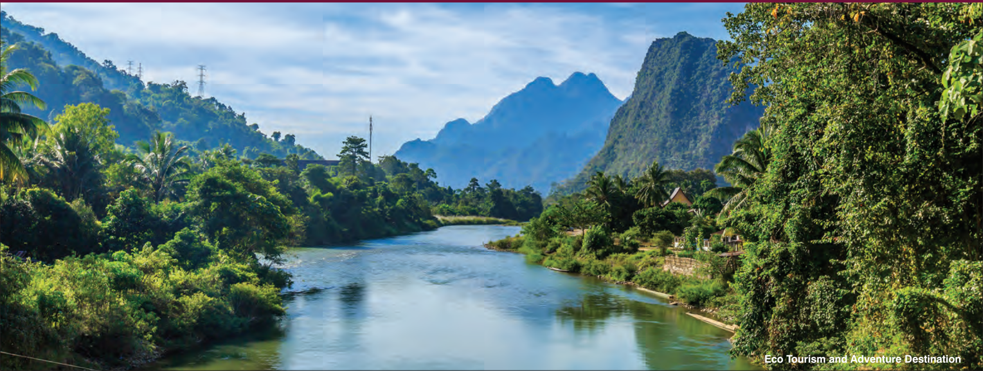
Eco Tourism and Adventure Destination