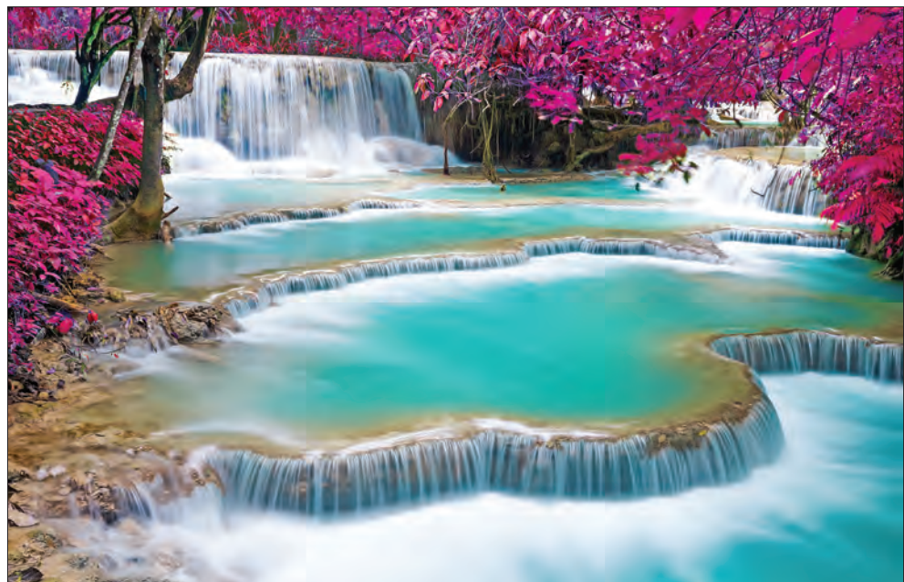
Kuang Si Waterfalls, Luang Prabang, is a popular attraction for foreign tourists visiting Laos.

"The aim is not to promote the hotel as a luxurious building, but much more than that, to establish it as a brand, as an experience through world