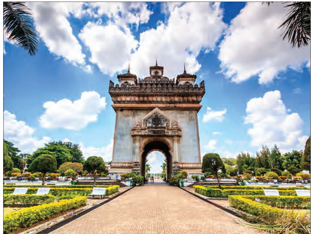
Patuxay Monument, Vientiane

The economic benefits from a sector that generated 15% of GDP in 2015 do not just favour local and national authorities, but have a positive impact on the budgets of thousands of households, with some families seeing their incomes jump ten-